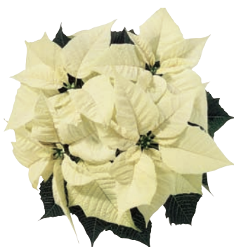
'Christmas Feelings White'