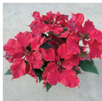
'Carousel Dark Red'