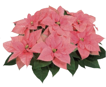
'Mars Lipstick Pink'