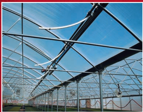
The Mid-Wing vent is specially designed to increase the efficiency of the Rainbow® Plus greenhouse.

We understand that no two plants are alike. That's why our greenhouses, including the Rainbow® Plus, can be customized to meet the specific needs of your plants. From vents to heaters to curtains, the Rainbow Plus will help you maximize yields. Benefits include: