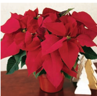
'Prestige Early Red'