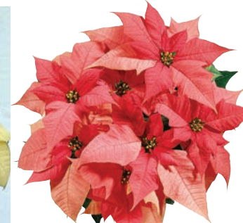
'Christmas Carol Pink'

had a slight pink cast and were held flat to slightly droopy. Centers had an open appearance because bracts had long petioles and there were few small bracts formed. Growth habit was round to spreading, and uniformity among plants was good. Plants flowered early to midseason and had medium vigor.