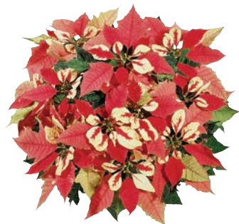
'Crazy Christmas Red'