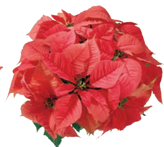
'Christmas Feelings Pink'