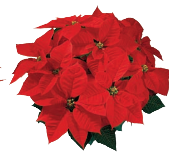
'Christmas Star Bright Red'