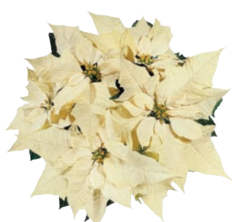
'Christmas Carol White'